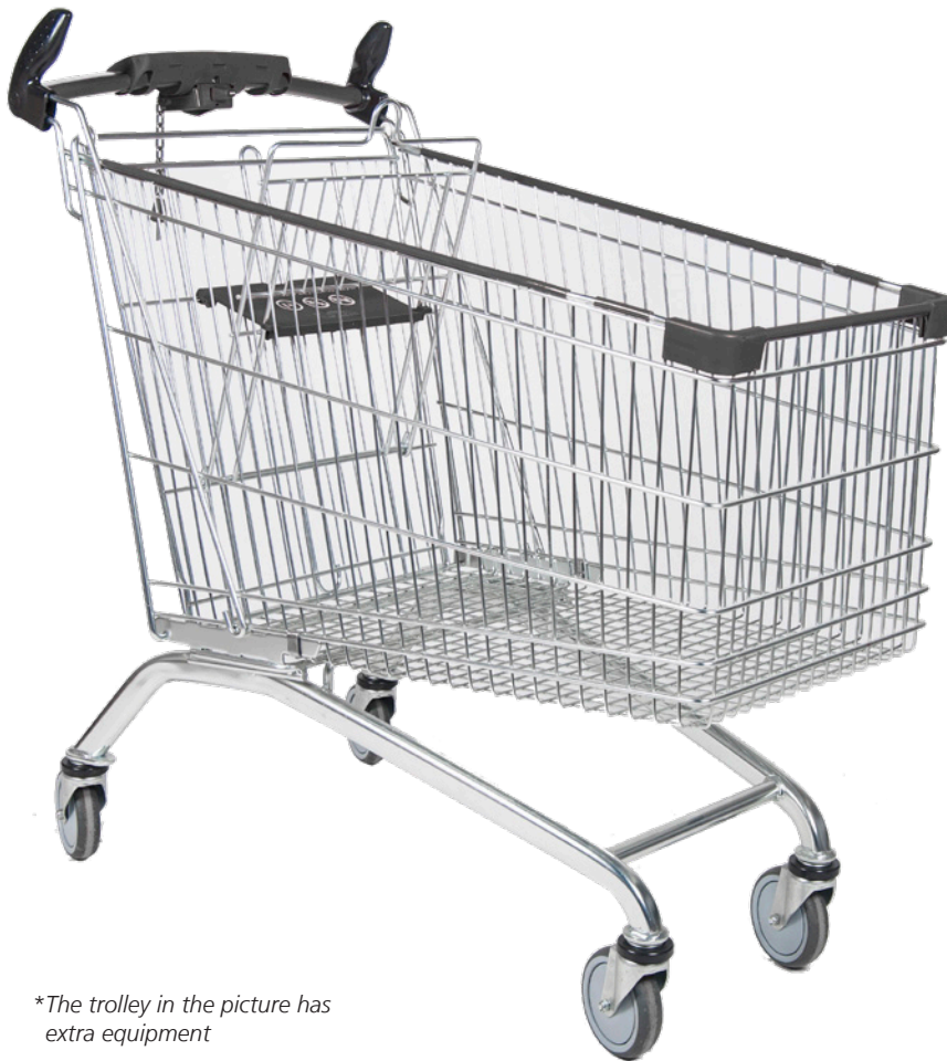
*The trolley in the picture has extra equipment